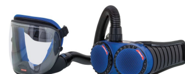
CleanAir Unimask with AerGO PAPR

Dont want to loose the Beard ask us about the UniMask PAPR Products and never shave again