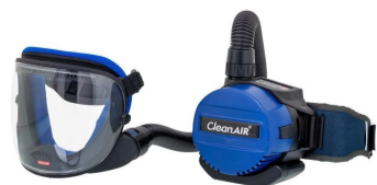
CleanAIR Unimask Basic

Dont want to loose the Beard ask us about the UniMask PAPR Products and never shave again